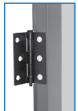
Hinges and Rivets