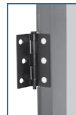
Hinges and Rivets