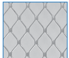
Close-up Amplimesh Grille